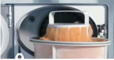
Large filter in the new dryers