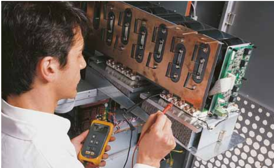
DEYS T14 A

wide-ranging expertise of our different specialists. The management of your infrastructure is co-ordinated by an equipment tracking information system.