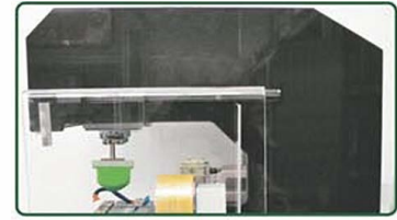
Stable granite stone machine structure