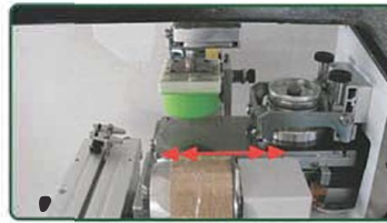
Platform in / out movement & pad clean underneath design for max. product size