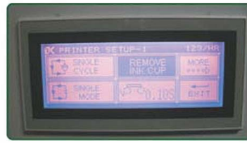
PLC control touch screen panel