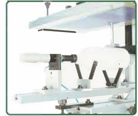
Air inflation unit