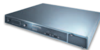
ASYS 006 A