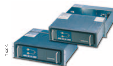
IT 003 C