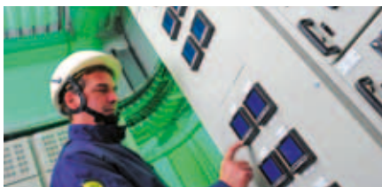
APPLI 571 A