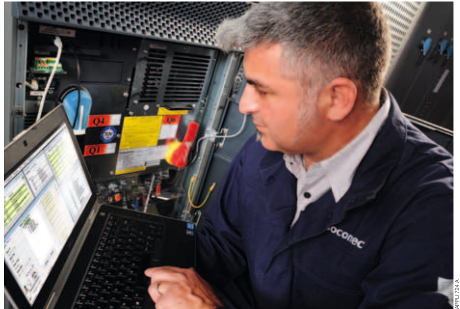
APPLI 724 A

The expertise and proximity of our specialists are there to ensure the reliability and durability of your equipment.