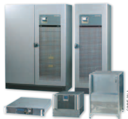
GAMME 381 A

Please contact us for any other requirement.