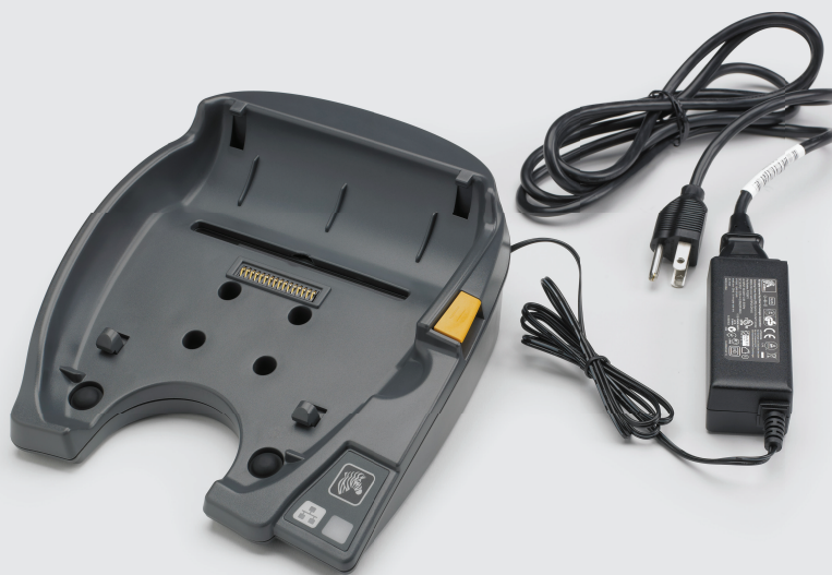
QLn420 charging and Ethernet cradle