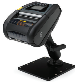
Plate and RAM mount arm (pictured) permits compact and fixed mounting to a forklift.