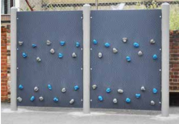
Twin Traverse Wall (2 Panels) Single sided

Our Traverse walls have hand and foot holds at varying heights so that a wide range of ages can enjoy them. From smaller single walls to double and even a challenging net feature we are sure we can find a wall to challenge you.