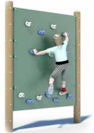
Single Traverse Wall (1 Panel)