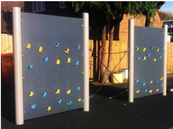
Twin Traverse Wall With Net (2 Panels)