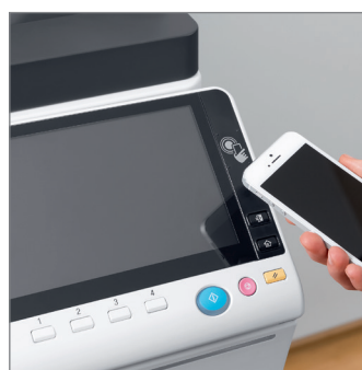
New area for Near Field Communication (NFC) Authentication

AirPrint® , provided as standard, allows printing from an iOS device (from iOS version 4.2 to 10.7 and later) and compatibility with Google Cloud Print , through the installation of a specific software connector.