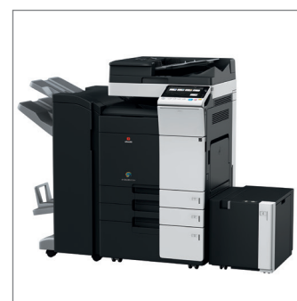
Configuration with FS-534SD Finisher, PC-410 Tray, LU-302 Large Capacity Tray, and DF-704 Document Feeder

On the operator panel there is a special area allowing connection with NFC (Near Field Communication) technology devices for authenticating users or using Bluetooth (optional).