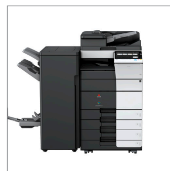
Configuration with SF-537SD Finisher, PI-507 Post-Insertor, RU-513 Connection Unit, PC-215 Drawers, LU-207 Side Drawer