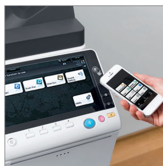
New 10.1" Touch-screen and NFC Authentication Area