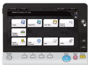
10.1" Colour Touch Screen with NFC authentication