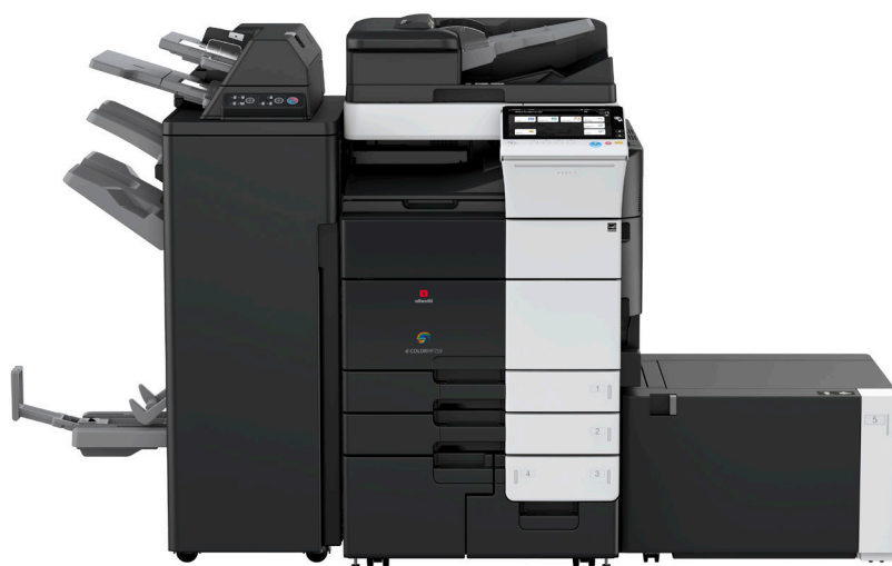
Configuration with FS-537SD Finisher combined with PI-507 Post-inserter, RU-515 Relay Unit and LU-205 Side Drawer