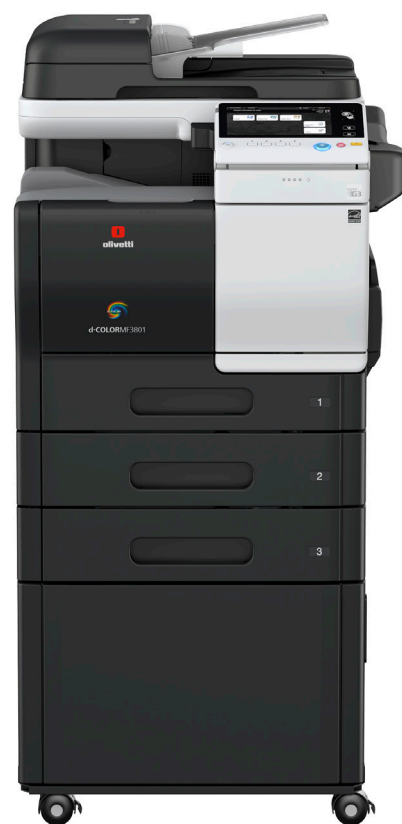
Configuration with 2 optional Paper Drawers and Copy Desk