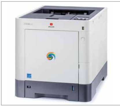
Compact and easy to use