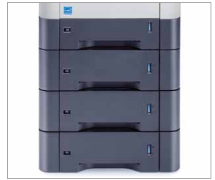
Flexible paper management