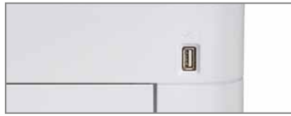
2-row LCD Operator Panel USB Port for direct printing from memory stick or pen