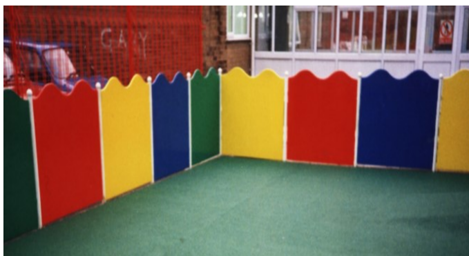
This coloured fencing is manufactured from high density 19mm polyethylene. It is maintenance free and graffiti resistant, available in a large range of colours it can be engraved to reveal coloured pictures, text etc. The posts are galvanised or powder colour coated round tubular steel.