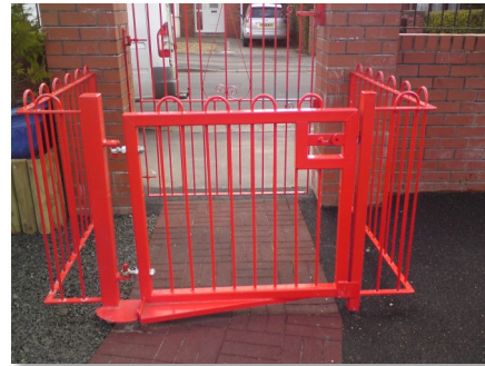
Pedestrian/Access gates have a self closing mechanism