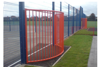
Blue twin court with orange goals.