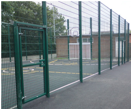
4m high wall with two self closing pedestrian gates.