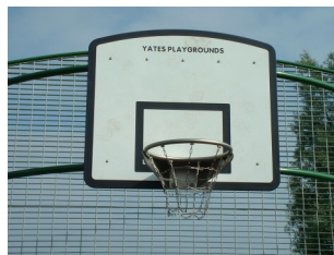
Polyethylene backboard and stainless steel hoop.