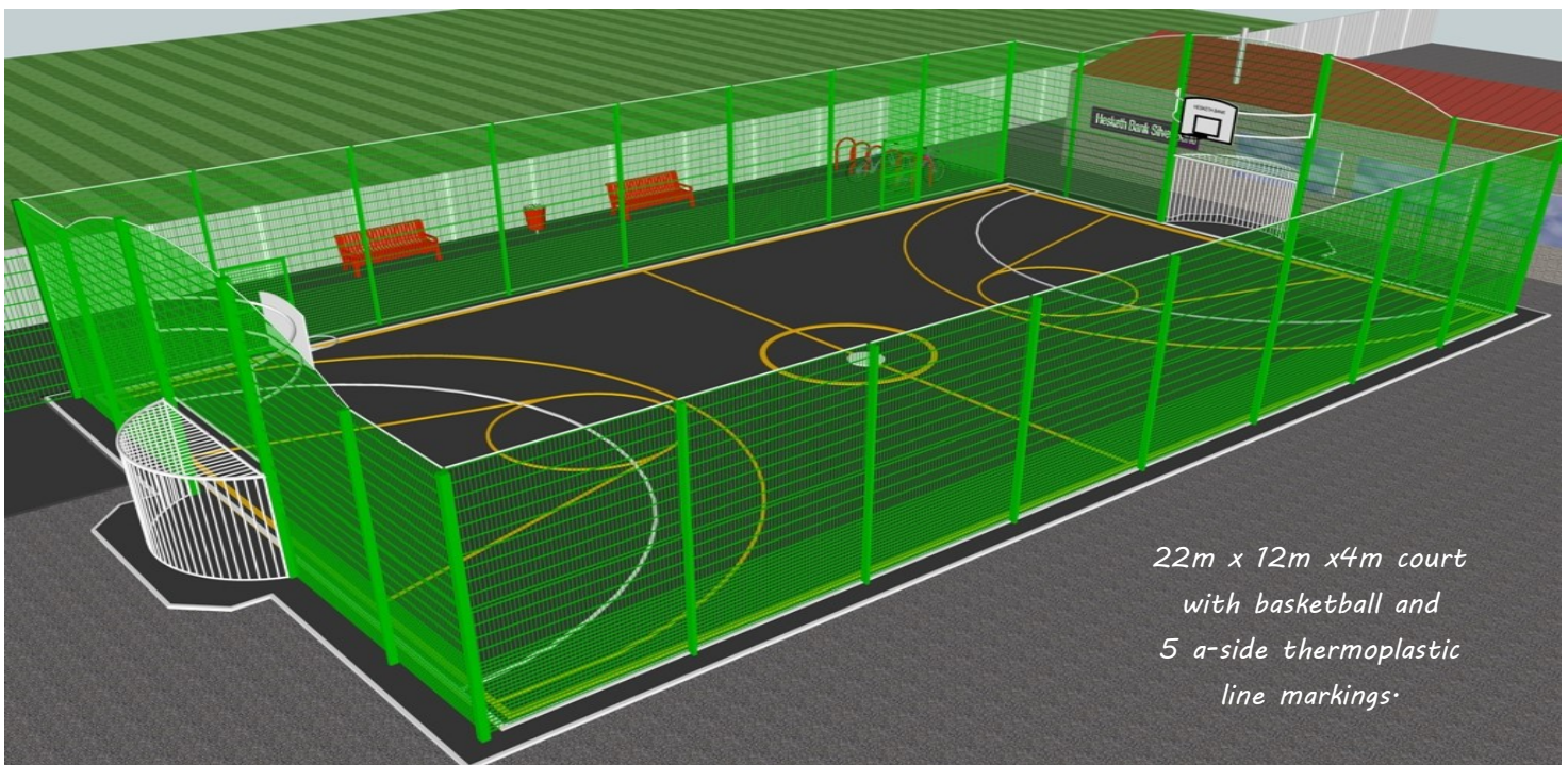
22m x 12m x 4m court with basketball and 5 a-side thermoplastic line markings.