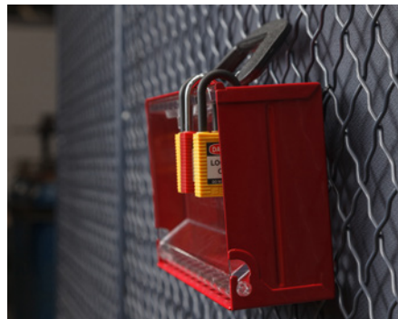
Group Lock Boxes