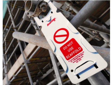
Scafftag® Scaffold Management