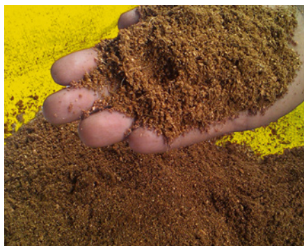
SpillFix® Granular Absorbent