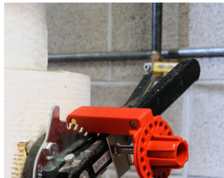
Ball Valve Lockout Devices