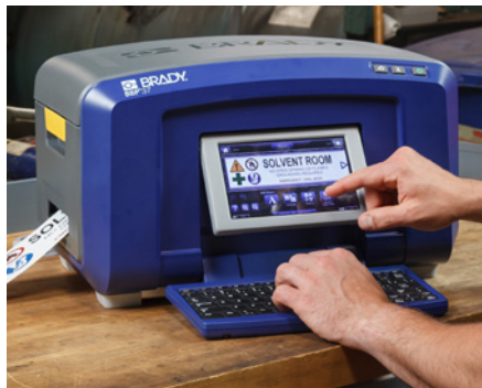
On-Demand Sign and Label Printers