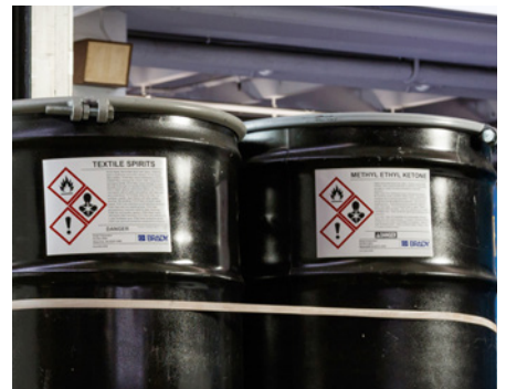
BS 5609 Compliant GHS Labels