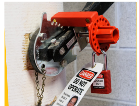
Butterfly Valve Lockout Devices