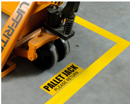
ToughStripe® Floor Marking