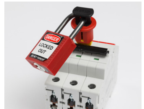
Circuit Breaker Lockout Devices