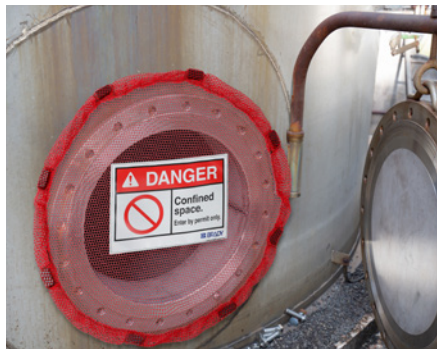
Confined Space Safety Covers