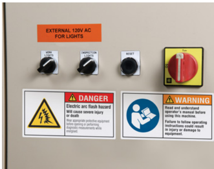
Arc Flash Labels