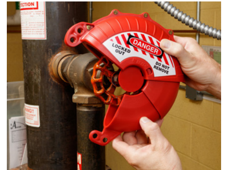
Collapsible Gate Valve Lockout Devices