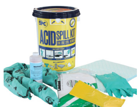
Spill Response Kits