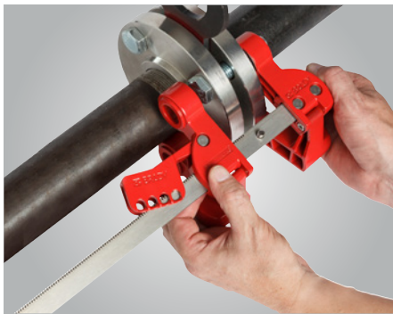
Blind Flange Lockout Devices