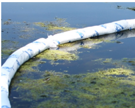
Absorbent Booms and Pillows