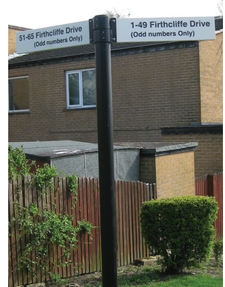
Aluminium finger post

Normally supplied with powder coated aluminium posts. The arms can be a choice of self-adhesive vinyl applied to an aluminium arm or, if vandalism is a major concern, use our Encapsulated Glass Reinforced Plastic printing process. Both finger options are fitted to the post with aluminium brackets.