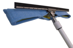
:: Window wash tool