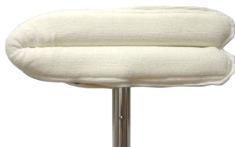
:: Curtain cleaner tool