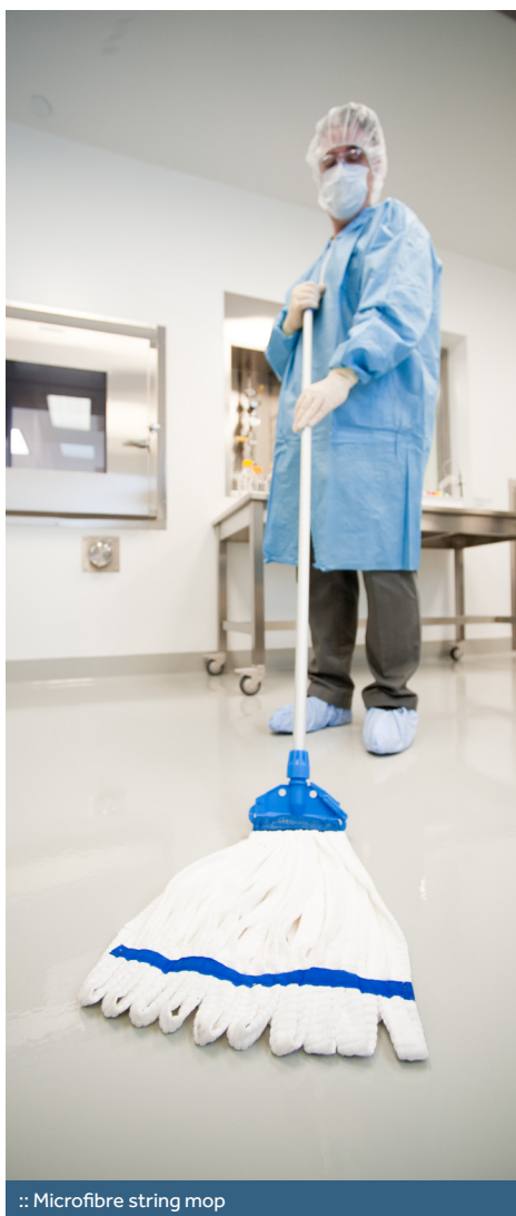
:: Microfibre string mop