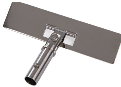
:: Mop head frame