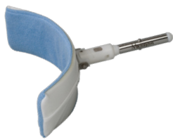
:: Tank Tool