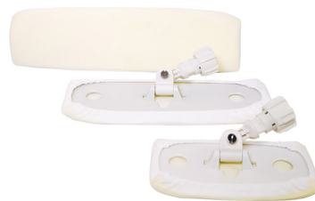
:: SlimLine Mop