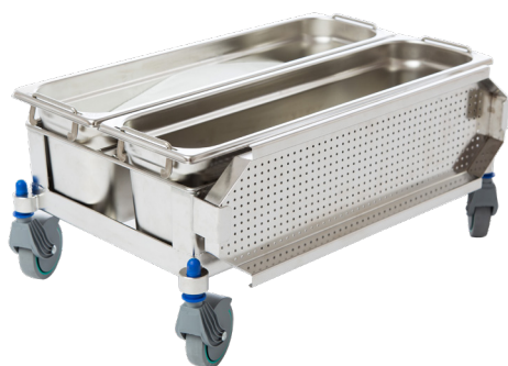
:: Stainless steel buckets, wringer and trolley