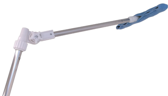
:: Accordion handle