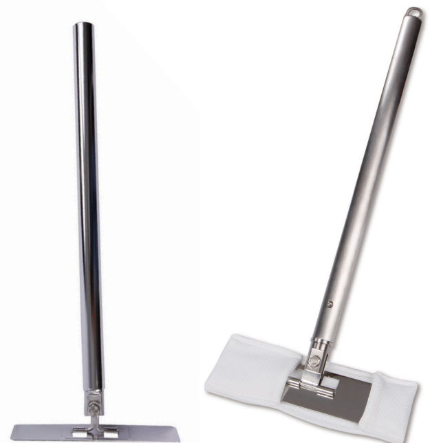
:: EasyReach Cleaning Tool, handle and Pad