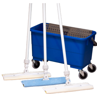
:: PocketMops bucket & wringer