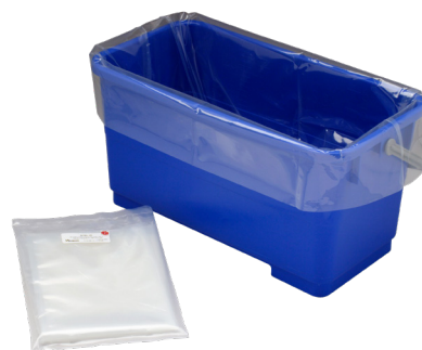
:: Bucket Liners