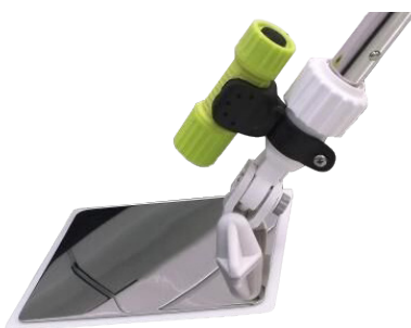
:: Inspection Mirror and optional flashlight