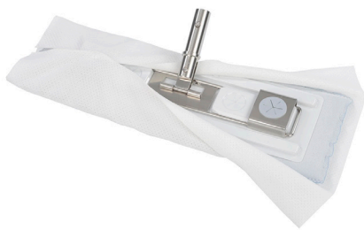
:: Mop Wipe system