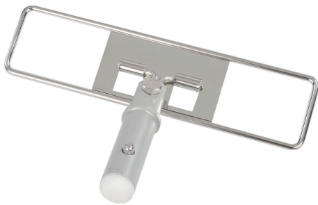
:: Mop head frame