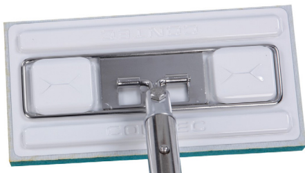
:: VertiKlean Max mop