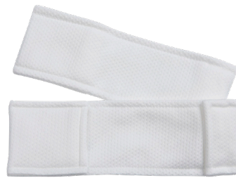
:: Two-ply quilted polyester pads