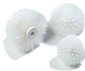
:: Cylinder Brushes (without covers)