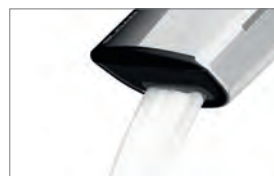
6 l/min Full Stream Aerated