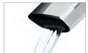
6 l/min Full Stream Laminar