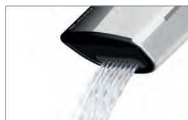
2 l/min Multi-laminar Spray

Individual aerator: Flow rates of 6 l/min down to a water-conserving 2 l/min with three different jet patterns