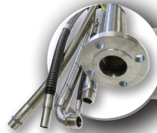
Metallic & PTFE Hose Assemblies