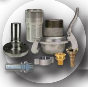
Hose & Pipe Fittings