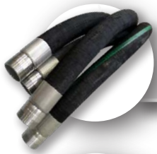
Rubber Hose Assemblies