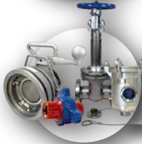
Engineered Fluid Transfer Couplings