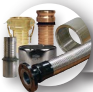
Crimp & Swage Fittings