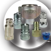
Quick Disconnect Couplings