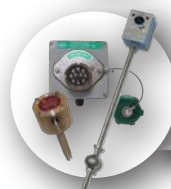
Liquid Level Sensing