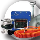
Terminal & Tank Truck Equipment