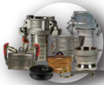
Cam & Groove