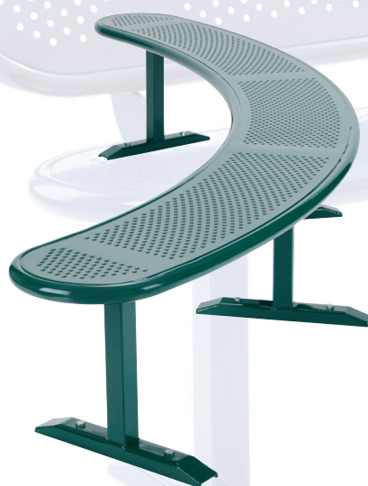
Ranger curved bench Length: 3m Inside radius: 2m Outside radius: 2.3m