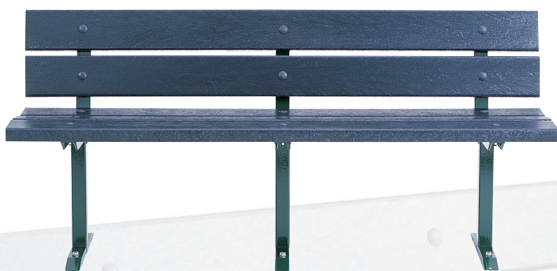
Forest-Saver seat Length: 1.8m

Forest-Saver boards are made from 100% recycled polythene waste supported by tough steel frames. The furniture can be bolted down onto hard ground or easily anchored onto soft ground using our patented Rootfast® anchor system – no need for the inconvenience and expense of concrete.