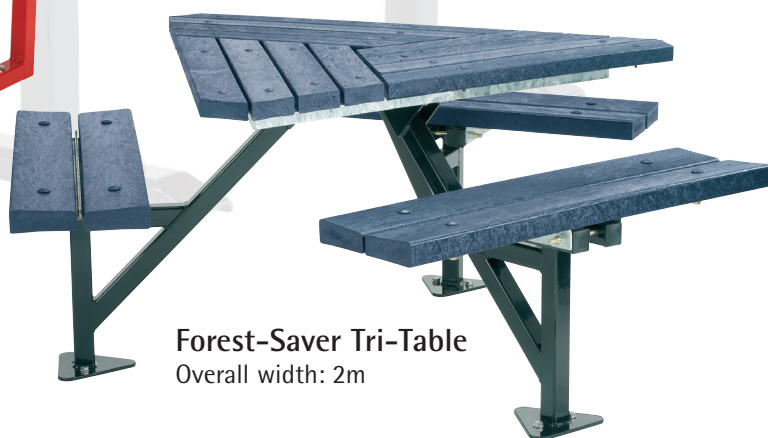
Forest-Saver Tri-Table Overall width: 2m