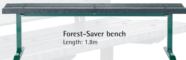
Forest-Saver bench Length: 1.8m