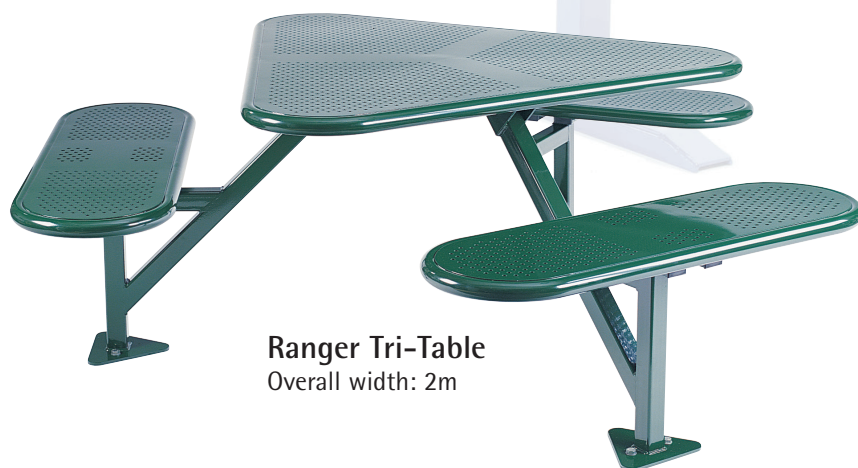
Ranger Tri-Table Overall width: 2m