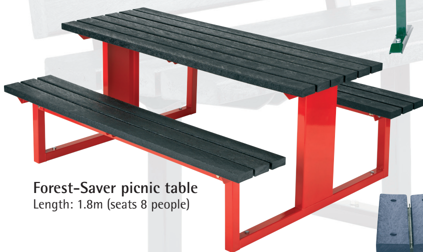
Forest-Saver picnic table Length: 1.8m (seats 8 people)