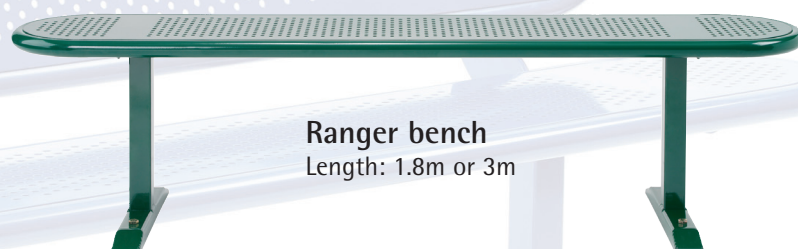
Ranger bench Length: 1.8m or 3m