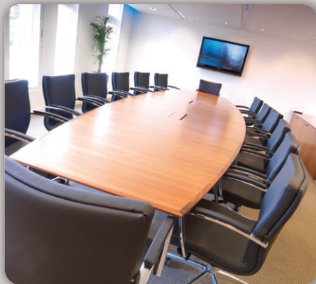
Boardroom Table 5.2m finished in crown cut walnut veneer with profiled hardwood edging, power/coms dock and integral cable management