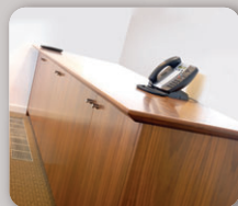
Credenza 6 door 3m finished in crown cut walnut veneer