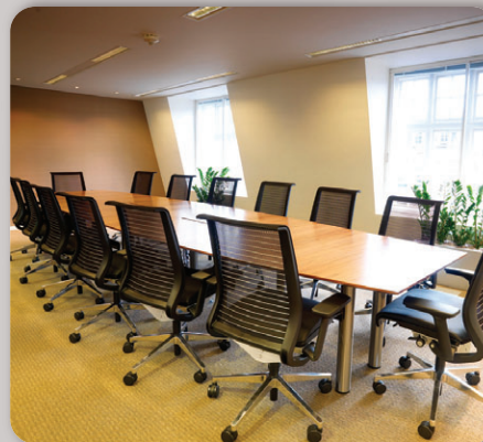
Meeting Room Tables x 2 5.2m and 4.8m finished in crown cut walnut veneer with power/coms docks