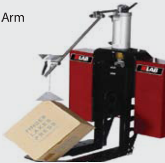
Package Support Arm