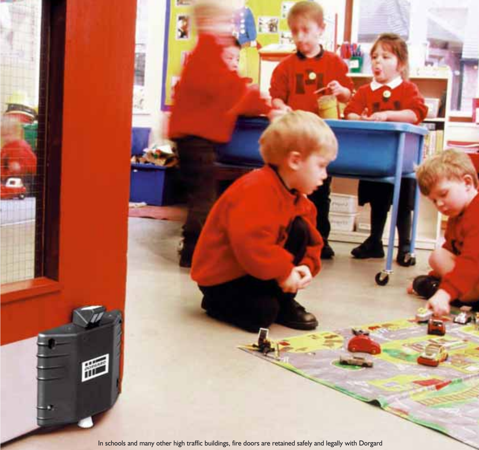
In schools and many other high traffic buildings, fire doors are retained safely and legally with Dorgard