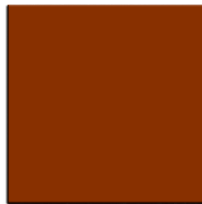
Brick Red (04C39)