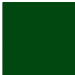
Racing Green (14C39)

The information detailed in this leaflet is liable to modification from time to time in the light of experience and of normal product application, and before using, customers are advised to check with Ronacrete Ltd, quoting the reference number, that they possess the latest issue. Any person or company using the product without first making further enquiries as to the suitability of the product for the intended use does so at his own risk, and Ronacrete Ltd can accept no responsibility for the performance of the product, or for any loss or damage arising out of such use.