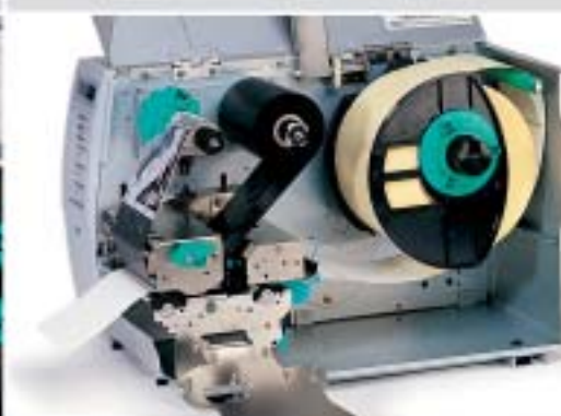
▲ A wide opening mechanism

TEC TOSHIBA TEC EUROPE Retail Information Systems