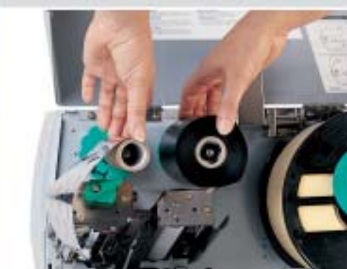
▲ Time-saving and minimal training due to fast and easy handling