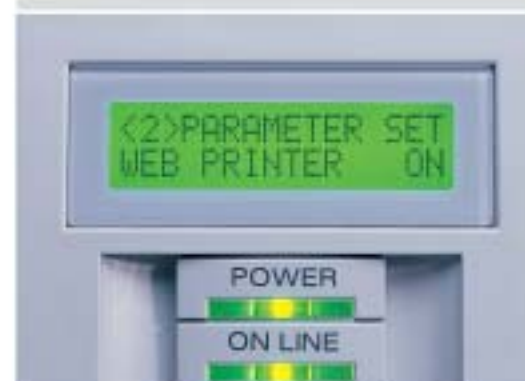
▲ User-friendly display