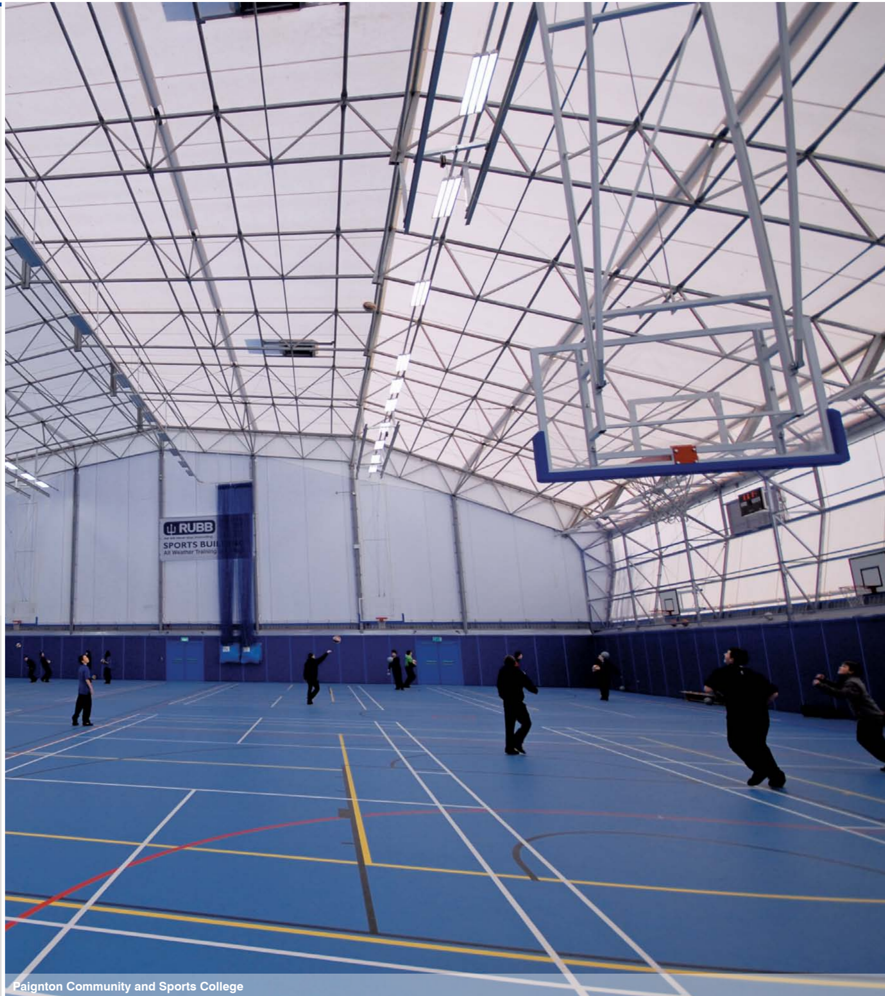
Paignton Community and Sports College