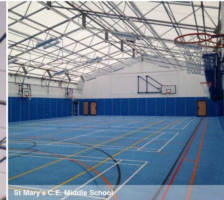
St Mary's C.E. Middle School

“ The Hub has dramatically increased the quality of teaching and learning within PE lessons ”