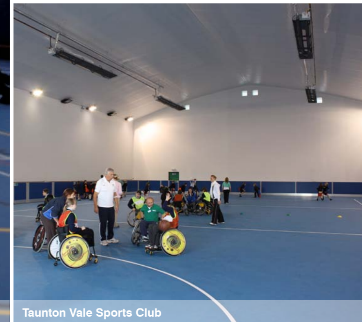
Taunton Vale Sports Club