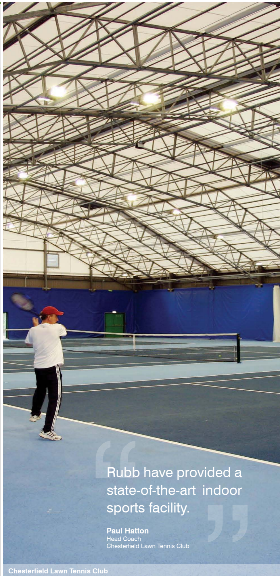
Chesterfield Lawn Tennis Club

Rubb facilities are full-featured buildings that can be resold, reconfigured, relocated and reused in a multitude of different applications. With life spans of 25 years and more, a Rubb sports building is a sound long-term investment.