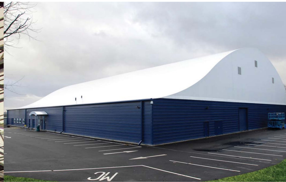
Blue Flames Sporting Club