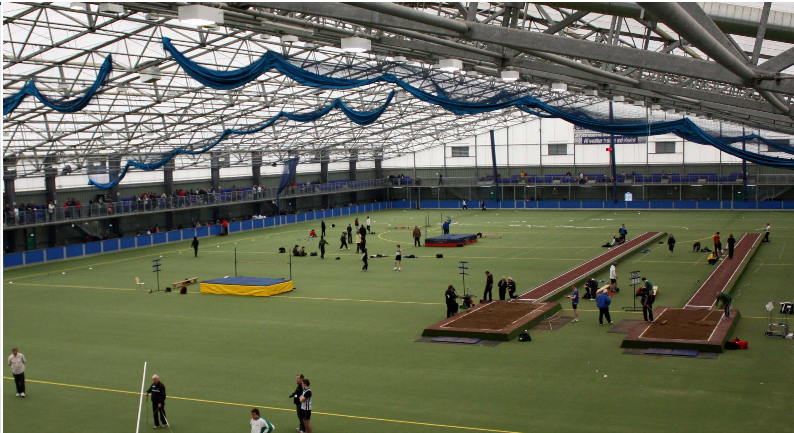
Meadowbank Sports Arena 70m Span x 145m Long BVC

Rubb facilities can also be resold, re configured, relocated and reused in a multitude of different applications. With life spans of 25 years and more, a Rubb sports building is a sound long-term investment.