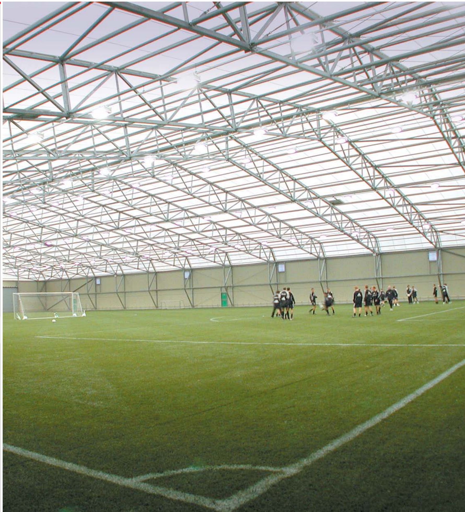
Newcastle United Football Club