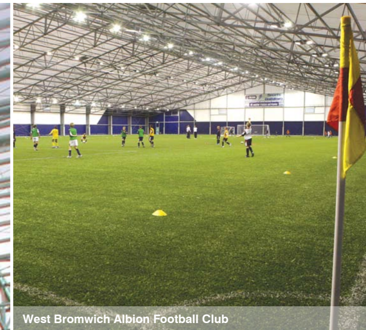
West Bromwich Albion Football Club

“Rubb fulfilled every aspect required whilst delivering a first class indoor facility.”