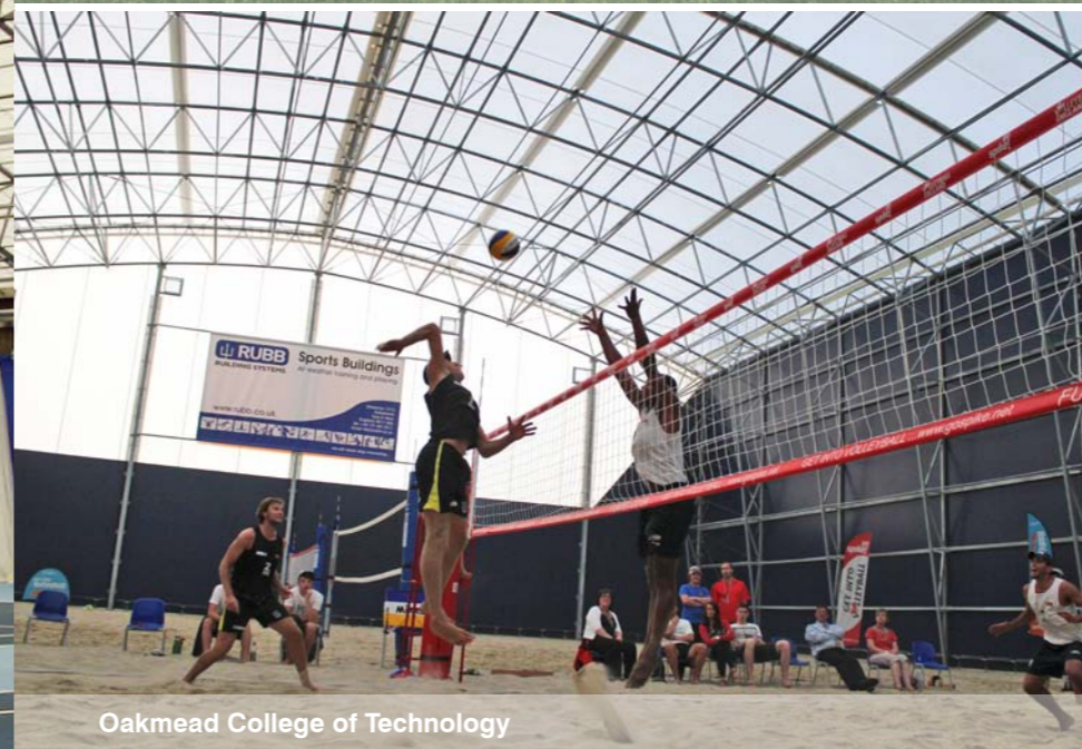
Oakmead College of Technology