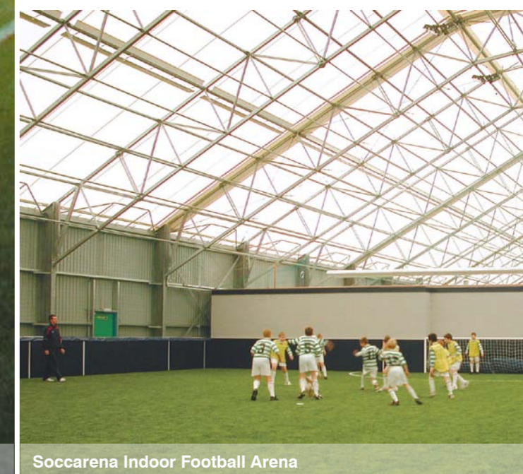
Soccarena Indoor Football Arena