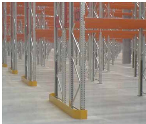
P90 copes with heights up to 30m and maximum loads of more than 30 tonnes. All components can be galvanised with permanent protection against environmental effects.