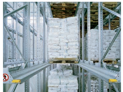
This smoothly formed pallet-carrying rail offers a safe, snag free surface. Pallet rails are carried on brackets that slot into the upright at 50mm pitch and are pin-locked in position.