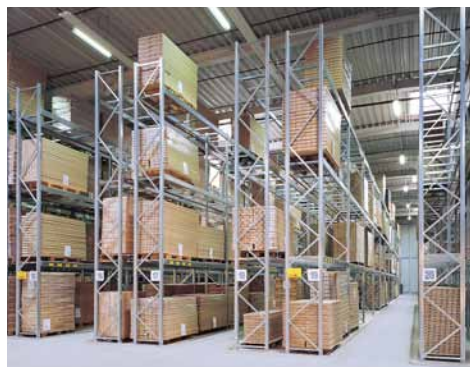
P90 drive-in racks can make up to 90% more storage space compared to conventional pallet racking systems.