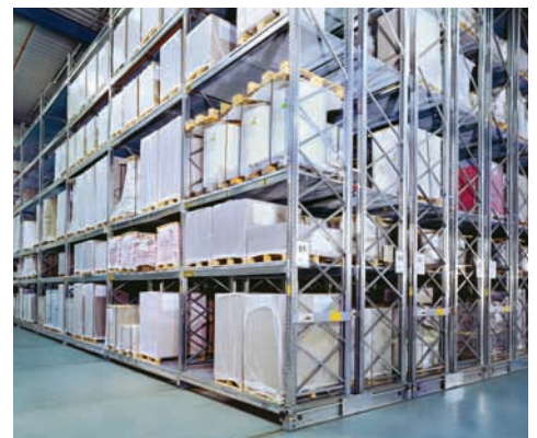
P90 for fast-moving seasonal items.