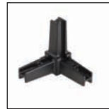
3-way corner joint