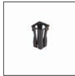
Black, White or Clear Inserts