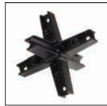
6-way corner joint