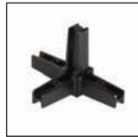
4-way corner joint