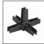
5-way corner joint