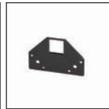
Double shelf support