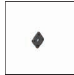
Plastic shelf spacer