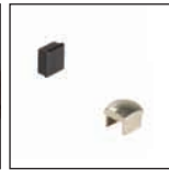
End caps - plastic or metal