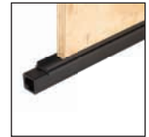
Cladding and glazing extrusions