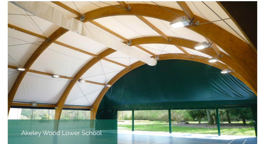
Akeley Wood Lower School

The material - a PVC-coated polyester fabric is self-extinguishing and resistant to abrasions, UV damage and designed to last for more than 20 years.