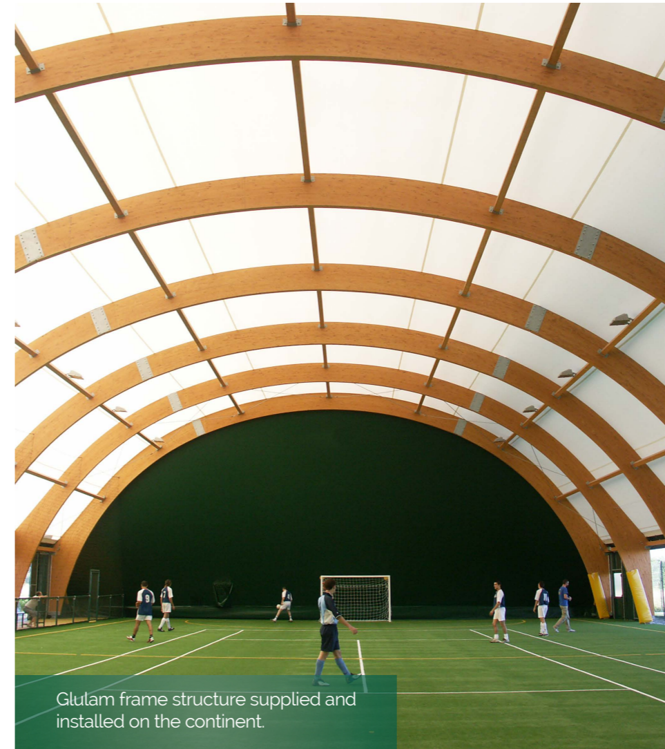
Glulam frame structure supplied and installed on the continent.