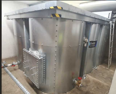
Typical 13m 3 steel tank lined internally. Supplying water to a residential sprinkler system.

Steel and aluminium, membrane lined tanks use an outer steelwork of hot-dipped galvanised steel sections, with panels of either high grade pre-galvanised steel or marine-grade aluminium. Internally the tanks are lined with a tailor-made synthetic rubber liner made from either EPDM or Butyl Rubber.