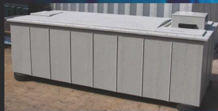
Typical one-piece and semi-sectional pre-insulated GRP tanks.