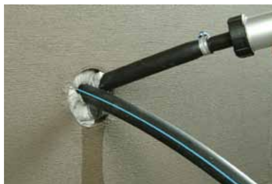
Then KÖSTER KB-Flex 200 is filled into the void using the KÖSTER Special Caulking Gun.