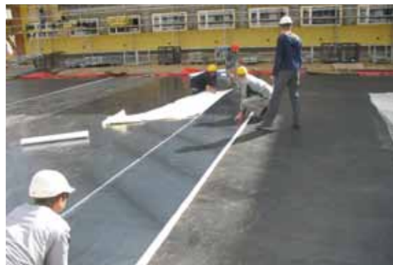
Waterproofing with KÖSTER KSK Membranes

e.g. two layers of polyethylene foil, and finally a protection layer in order to not destroy the waterproofing layer with subsequent building activity.