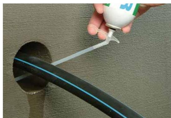
A PU-Foam is injected in order to have a backing for the KÖSTER KB-Flex 200.

While a wall area may be easy to waterproof, a pipe and cable penetration is not. The main problems that occur with pipe and cable penetrations are possible movements of the pipes or cables, and that materials passed through pipe and cable penetrations have very different characteristics, (polymers, concrete, metal etc.). The waterproofing solution has to be plastic, (as opposed to "elastic"), so that movements can be absorbed and bonding to a wide variety of materials is possible. Sometimes a cable may have to be removed or a new cable routed. The KÖSTER KB-Flex 200 System provides the solution for this problem even if it is a repair with active water ingress.