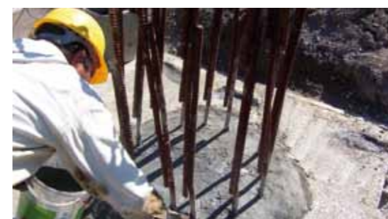
Waterproofing of the pile head with KÖSTER NB 1 Grey