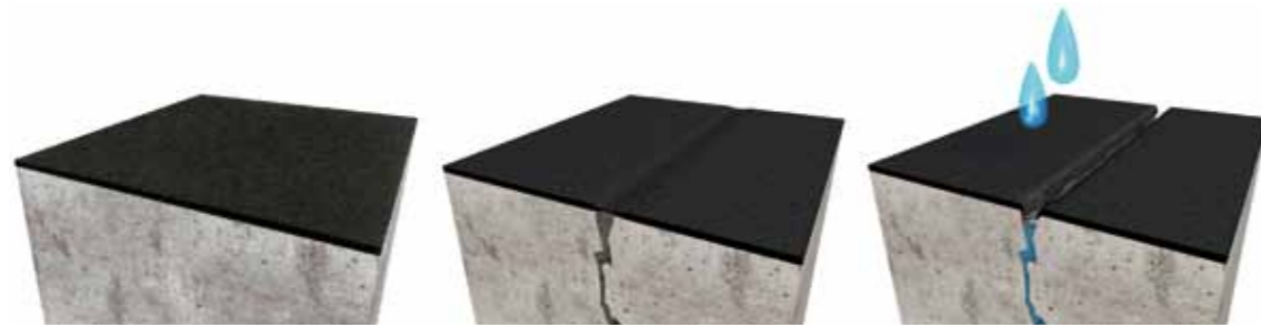
1. Elastic but not crack bridging: The waterproofing layer does not withstand the permanent water pressure.