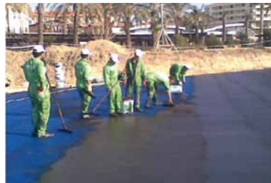
Waterproofing with KÖSTER Deuxan®

For the waterproofing of a slab cementitious systems, bituminous liquid applied systems, or membranes can be used. KÖSTER KSK membranes have the advantage that one can