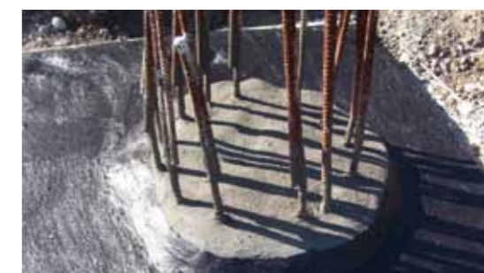
Connection of the area waterproofing (KÖSTER Deuxan®) to the pile head waterproofing