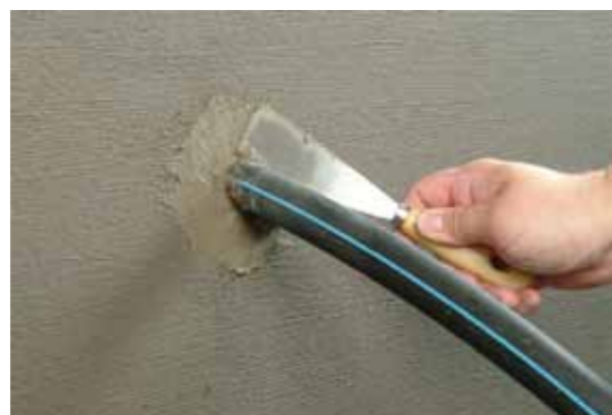
The pipe penetration is now waterproof. In order to protect the waterproofing the area around the pipe or cable is plugged with KÖSTER KB-Fix 5.