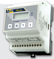
Output range of 0 to 10 ppm