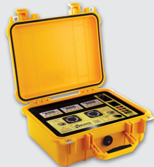
Long-life solid state zirconia sensor