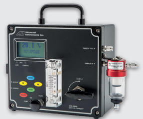
Compact and lightweight