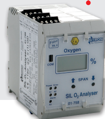
Analyzer and galvanic isolation barrier