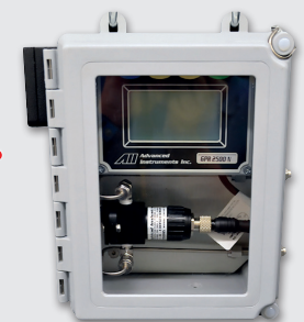
Can measure in pure CO 2 with XLT sensor