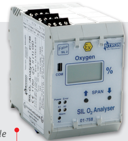
2 configurable alarm outputs