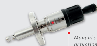
Manual or automatic actuation