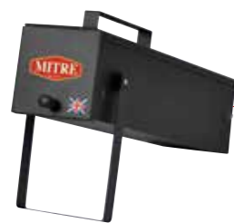
HQ5 Lightweight Heated Electrode Dispenser