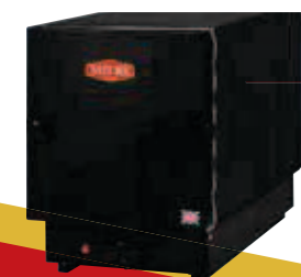
S50-S Digitally Controlled Drying Oven