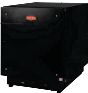
SH5-MK1 Digital Thermostat Controlled Drying/Baking Oven