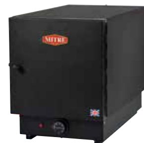
S50 Thermostatically Controlled Drying Oven