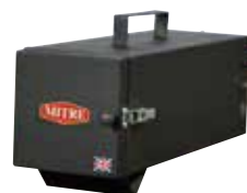
HIQ15 Insulated Quiver