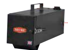
P04 Thermostatically Insulated Quiver