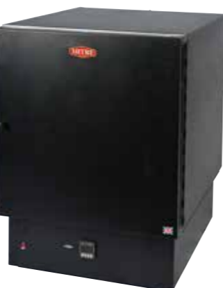
HT3/HT4 Digitally Controlled Baking Oven