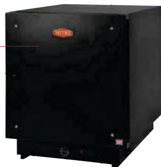
S06 Thermostatically Controlled Stationary Oven