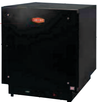
SD6 Digitally Controlled Stationary Oven