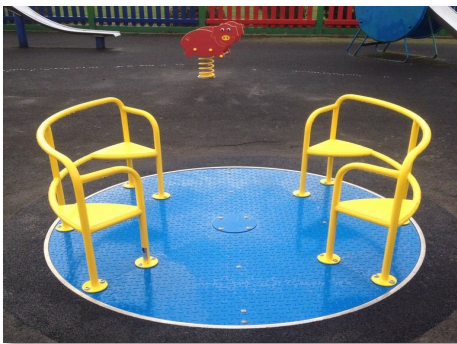
2.0m ability roundabout