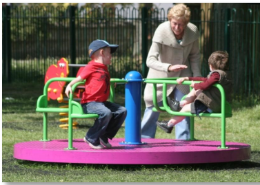
Violet & light green