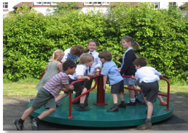
Dark green & ruby red