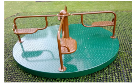
Dark green & Brown