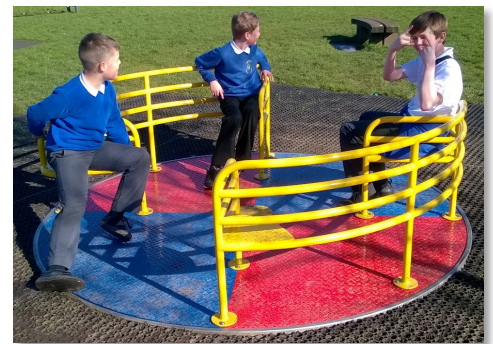
2.5m ability roundabout

Installed flush to the ground these easily accessible roundabouts can be enjoyed by users of all abilities. Standing, seated or those who are in a wheelchair.