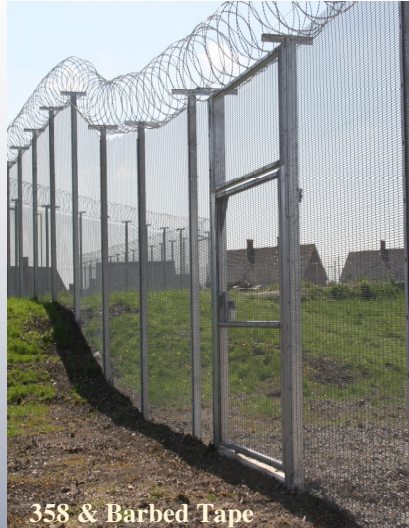
358 & Barbed Tape