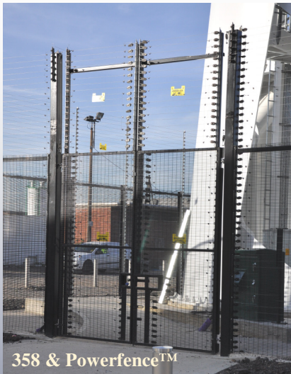
358 & Powerfence™