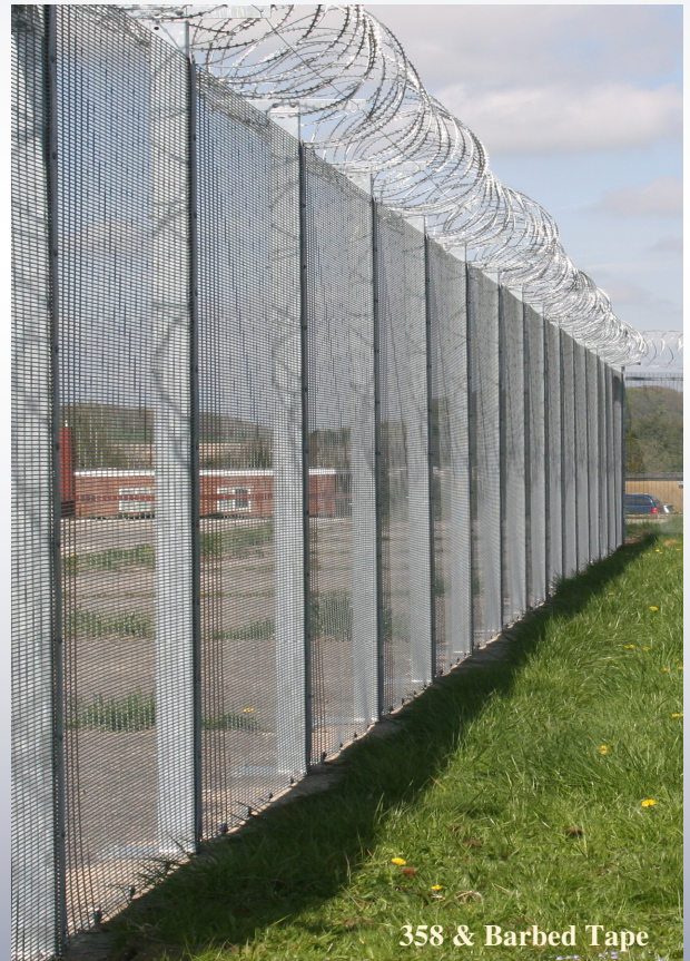
358 & Barbed Tape

JB Corrie provide design assistance from the outset. We are able to attend site & consult and advise then prepare drawings and proposals for your or your clients acceptance..