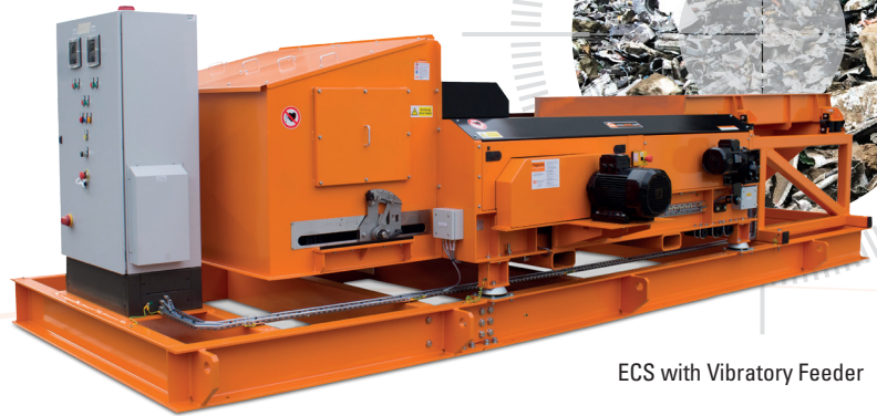
ECS with Vibratory Feeder