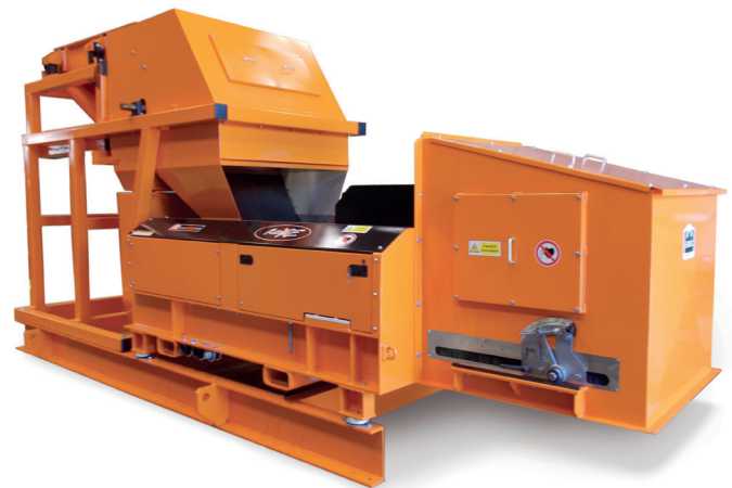
ECS with Magnetic Drum Separator