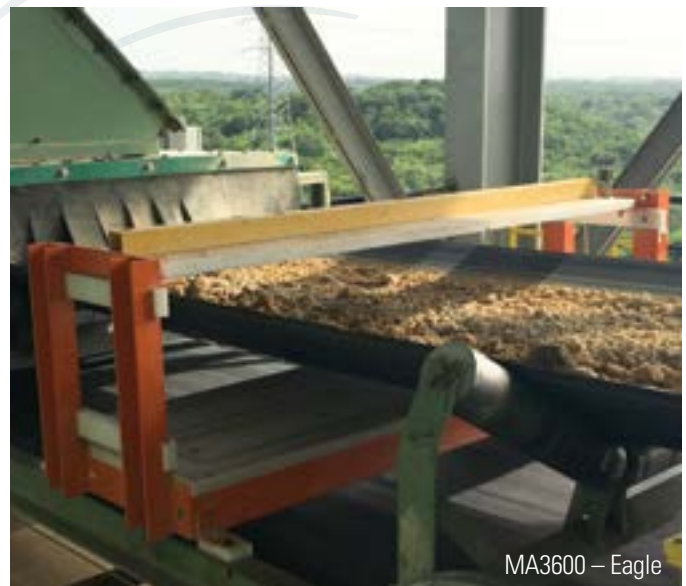
MA3600 – Eagle