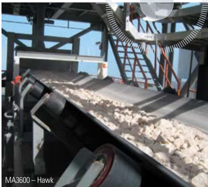
MA3600 – Hawk