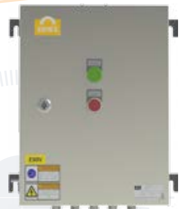
QM3500 Control Unit