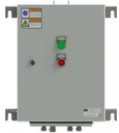
MA3500 Control Unit

Both MA and QM models are also available in Hi Power versions that offer enhanced detection sensitivity whilst still maintaining ease of use and minimal on-site adjustments. These features ensure that all Eriez MetAlarm detectors are extremely practical for users in any industrial environment.