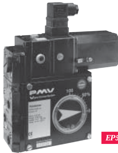
EP5 Fail Freeze

It features a rugged design, high gain, high capacity gold plated spool valve, external zero adjustment, gauge ports, replaceable filter, tapped exhaust port, all in an IP65/NEMA 4 enclosure.