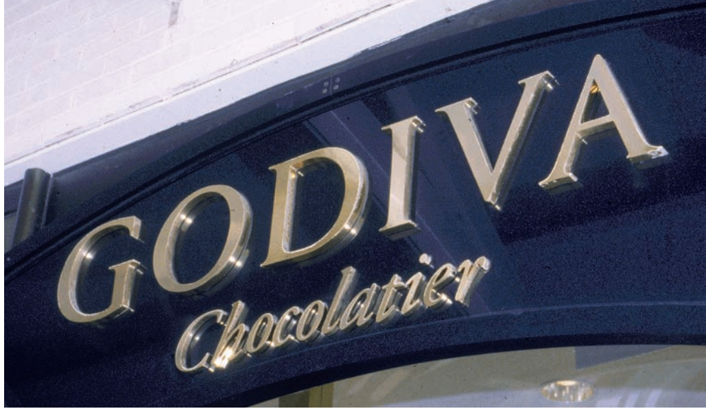
Built up brass letters