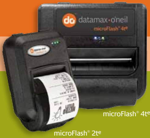
microFlash® 4t e