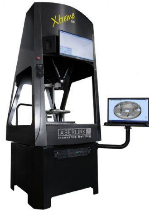
Latest Aberlink Measuring Machine

Rowan Precision are a well-established UK manufacturing company, based in the West Midlands, with a proven quality system, maintaining a rigorous inspection regime ensuring all components are correct to specifications.