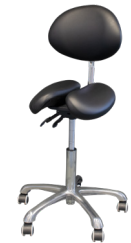
Split Seat Saddle Stool with Backrest