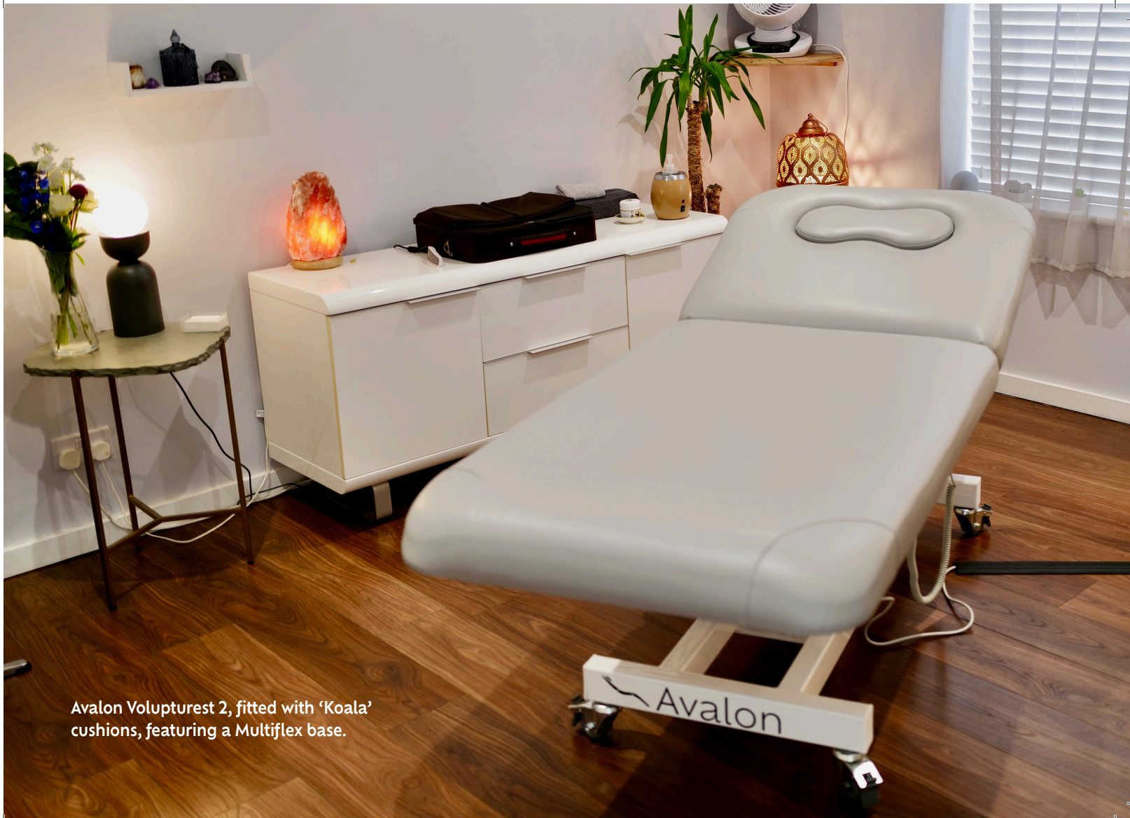
Avalon Volupturest 2, fitted with 'Koala' cushions, featuring a Multiflex base.