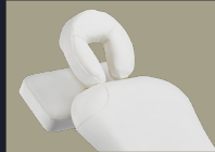
Face Cradle & Arm Support Set