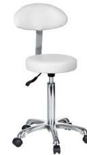
Circle Stool with Backrest