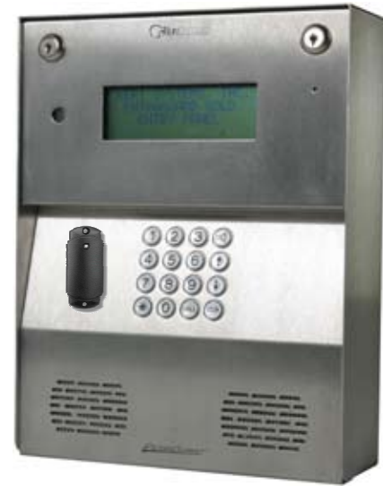
The EGS-WUPP includes an MS-3000 proximity reader

Keri's Silver Walk-Up Package addresses the basic telephone entry application, namely visitor and resident control for the main entrance to a building. The connections are already made inside the box. The installer needs only to mount the unit, connect a phone line, the power supply, the connection to the door strike, and then decide how unit programming will be done. Once connected to the PC (either directly, via modem, or via TCP/IP) simply run Auto-Configuration. A PXL-500GP comes already installed and wired inside the housing. Cards are enrolled bulk or one-at-a-time by presenting them to the reader. A second door may be controlled simply by plugging an SB-593 to the PXL-500GP and connecting a second reader. A Wiegand version is also available ( EGS-WUPW with a P-300 proximity reader).