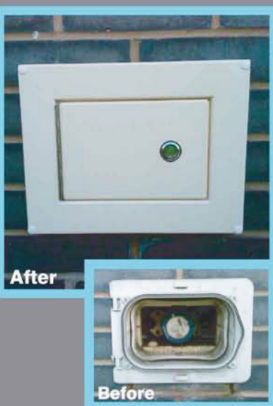
OB22 Water Meter Overbox