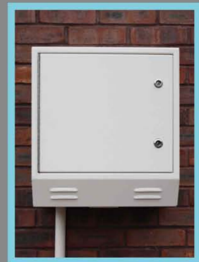
OB2 hook on overbox