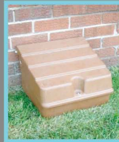
Semi Submersible Gas Meter Box

An unobtrusive brown meter box that is designed to be partially buried in the ground. Developed to house the lower cost metal cased U6 and G4 meters when used with a water resistant seal (sold separately), this meter box is fully approved by Sensus Metering, Krom Schroeder, GTC, IPL, Core Utilities and British Gas Connections.