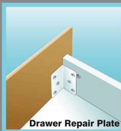
Drawer Repair Plate