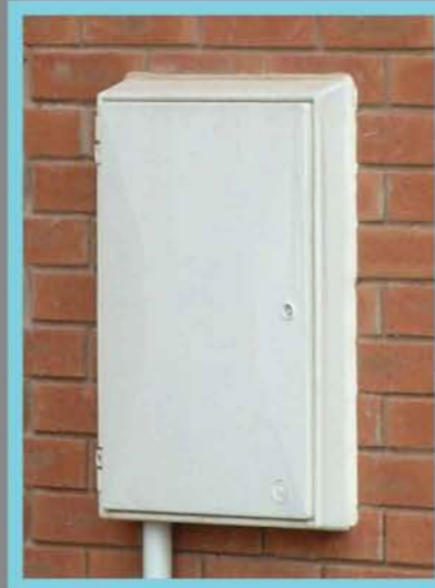
Semi Recessed Gas Box