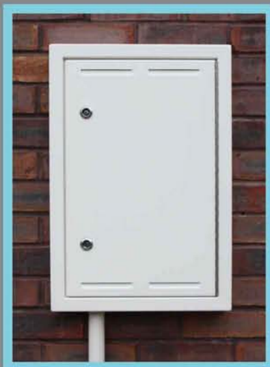
OB8 Illustrated (Gas)