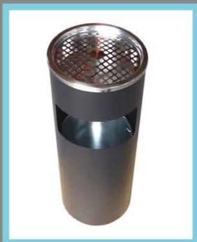
Lobby Style Cigarette Bin