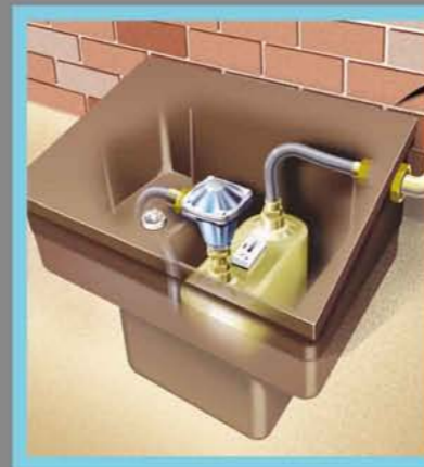
OB10 semi submersible lids