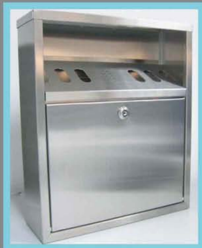
Best Value Cigarette Bin