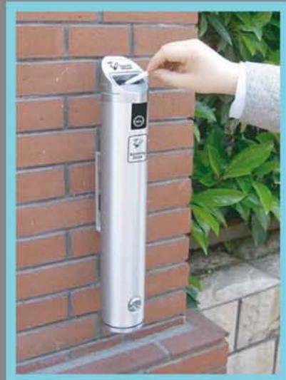
New Cigarette Bin