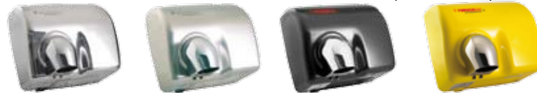
A (l) EP