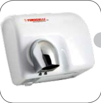
A (b) EP