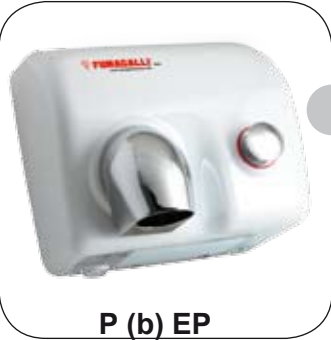
P (b) EP

Other colors available (with push button)