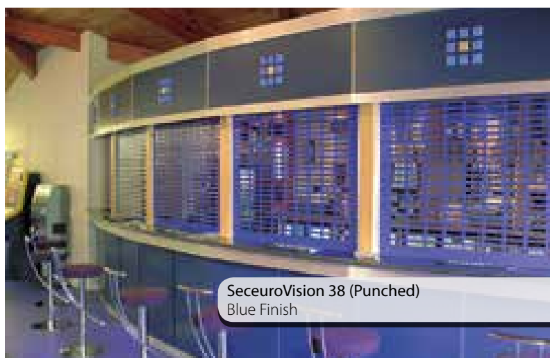
SeceuroVision 38 (Punched) Blue Finish