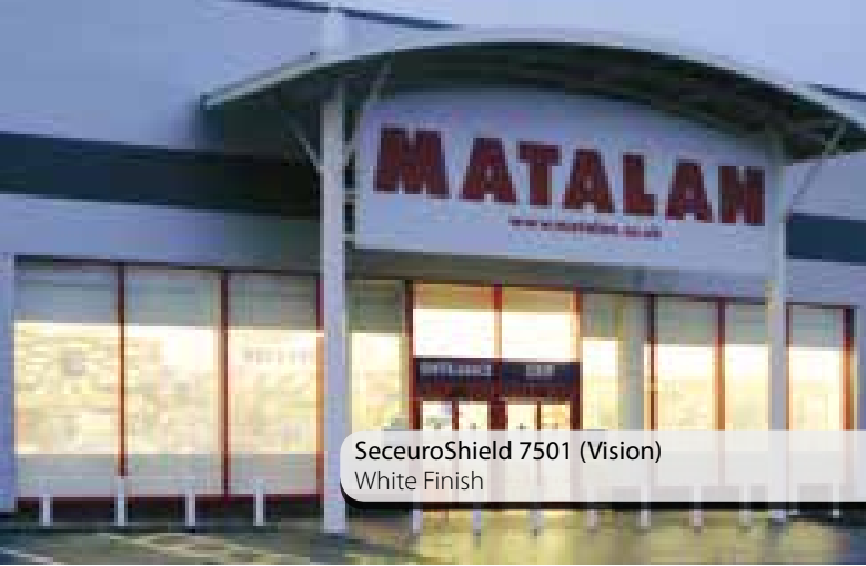
SeceuroShield 7501 (Vision) White Finish