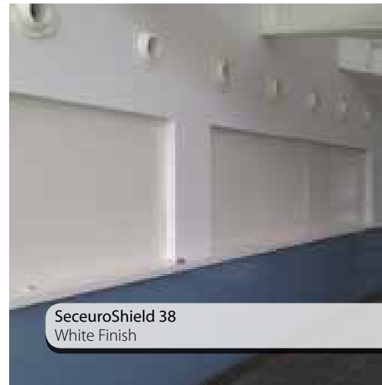
SeceuroShield 38 White Finish