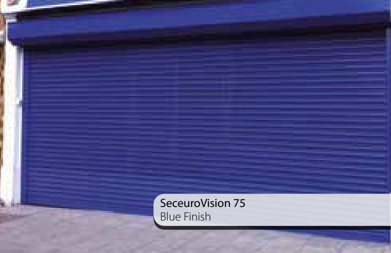
SeceuroVision 75 Blue Finish