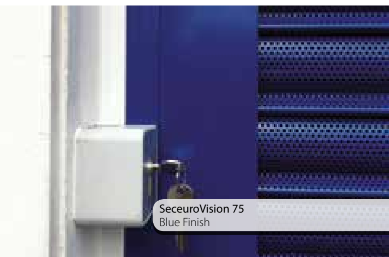
SeceuroVision 75 Blue Finish