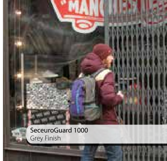
SeceuroGuard 1000 Grey Finish