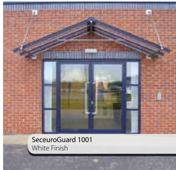
SeceuroGuard 1001 White Finish