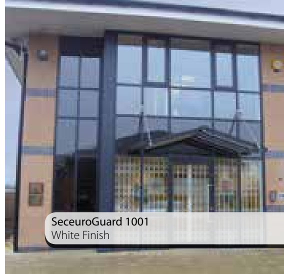
SeceuroGuard 1001 White Finish