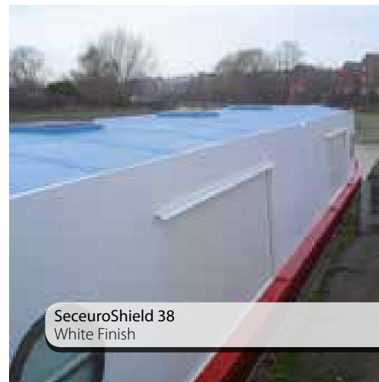
SeceuroShield 38 White Finish