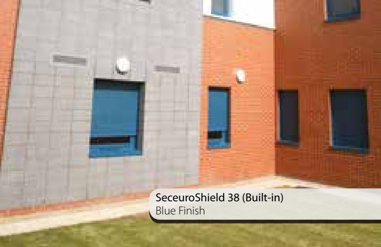
SeceuroShield 38 (Built-in) Blue Finish