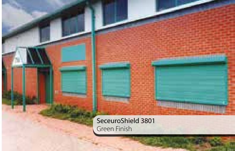
SeceuroShield 3801 Green Finish