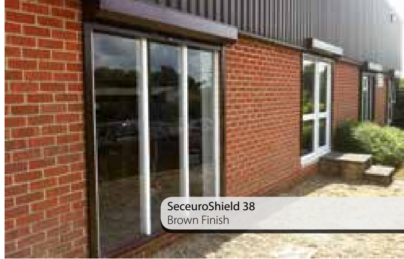
SeceuroShield 38 Brown Finish