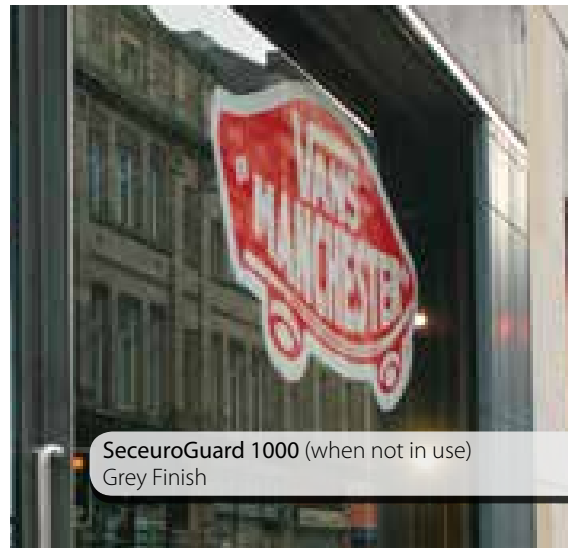
SeceuroGuard 1000 (when not in use) Grey Finish