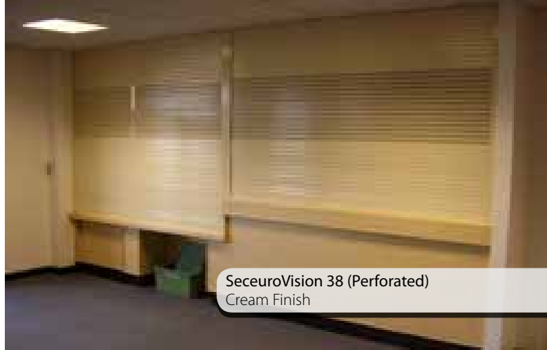
SeceuroVision 38 (Perforated) Cream Finish