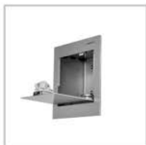
saniApp air freshener with magnetic locks