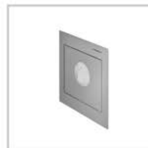
saniApp sanitary bag dispenser with magnetic locks