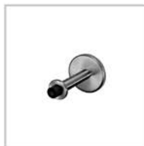
saniApp door stopper hook