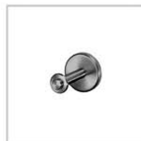
saniApp wall hook for toilet paper rolls or clothes