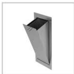
saniApp waste bin (approx. 5 liters holding capacity)

The saniQub cubicle system can be equipped with saniApps, the exclusive range of high quality accessories, providing functional design solutions uniformly integrated into the dividing wall. The saniApps, made entirely of brushed stainless steel, range from standard equipment such as brush sets or toilet paper holders to stainless steel mirrors and air fresheners offering practical design and a stylish appearance. The convenient KEMMLIT accessories for public washroom facilities can easily be purchased through the KEMMLIT online shop at shop.kemmlit.de . It is also possible to use standard products and accessories.