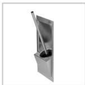
saniApp brush set