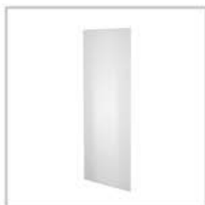
saniApp stainless steel mirror in different sizes