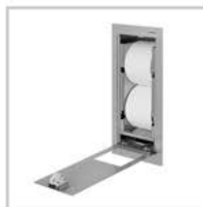
saniApp toilet paper holder