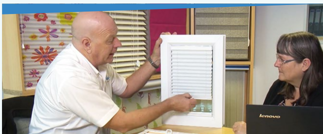
Founded in 1995, we are a family run business

Installation is then carried out by our experienced fitters and every last detail of the job will be carefully prepared before arrival. So there will be no delays, no missing parts, and no surprises. The last thing you need is for your beautiful blinds to be installed unprofessionally or to have your home left in an untidy state.