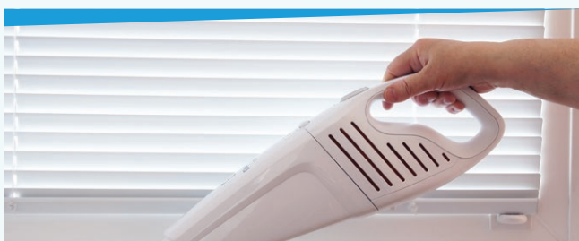
Exceptional service from enquiry to installation