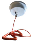
IR Ceiling Pull