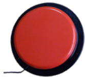
Big Red Button