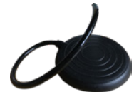
Air Disc Pad